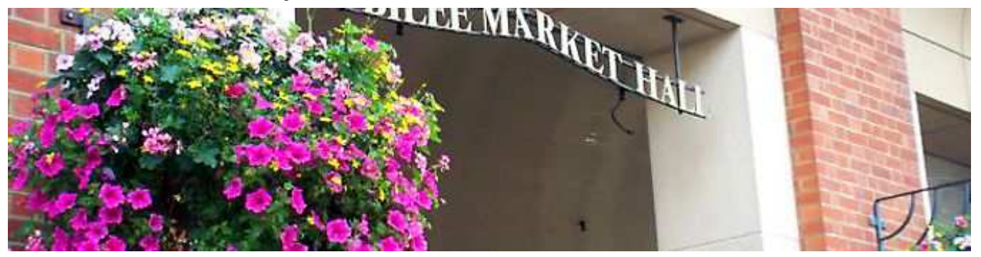
On Mondays, Jubilee Market is dedicated to Antiques; from Tuesday-Friday, a General Market operates, with traders selling clothing and household goods, and on Saturday and Sunday Jubilee Market offers arts and crafts.